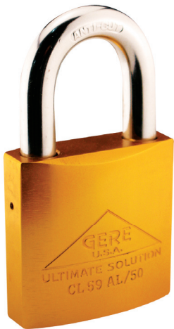
Solomon Gold Colour Code: Y